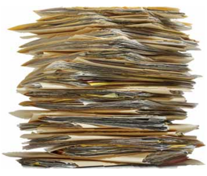
File Folders, Brochures & Pamphlets, Greeting Cards