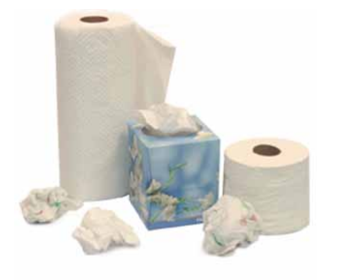
Paper Towel, Facial Tissue & Toilet Tissue