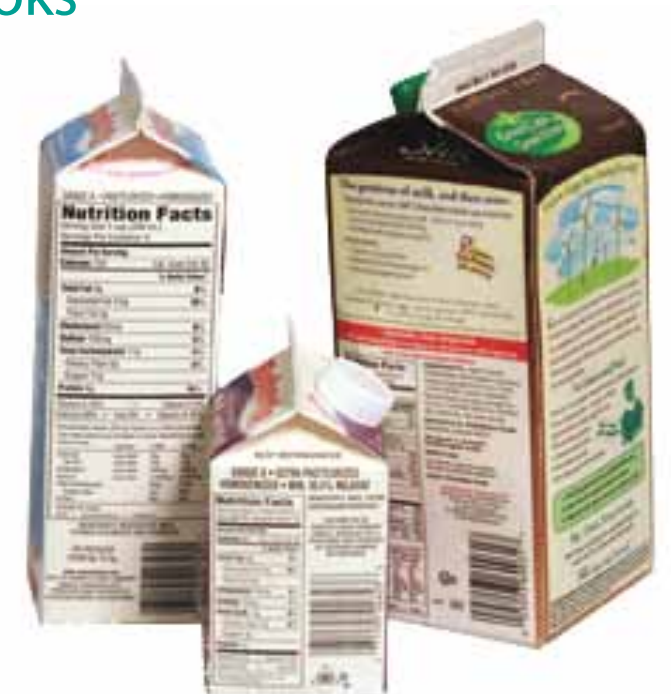
Drink Cartons *no foil drink pouches or cartons