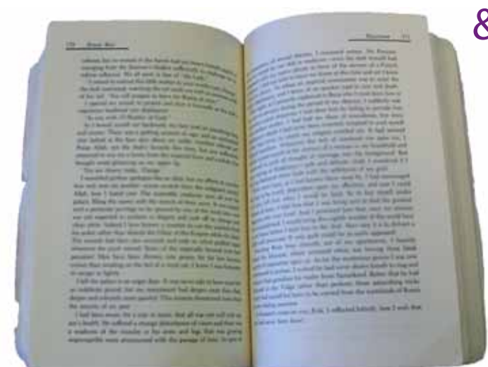
Magazines, Catalogs & Softcover Books