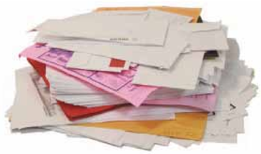
Junk Mail & Copier Paper