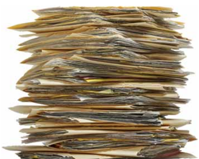
File Folders, Brochures & Pamphlets, Greeting Cards