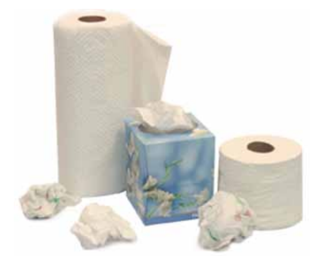
Paper Towel, Facial Tissue & Toilet Tissue