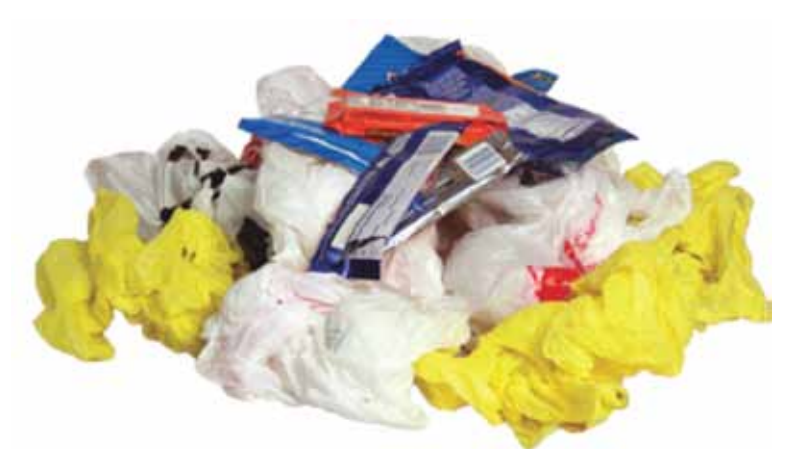
Plastic Bags & Packaging

No flammable, toxic, hazardous, medical waste/ syringes (including those inside containers) & plastic 6 pack rings