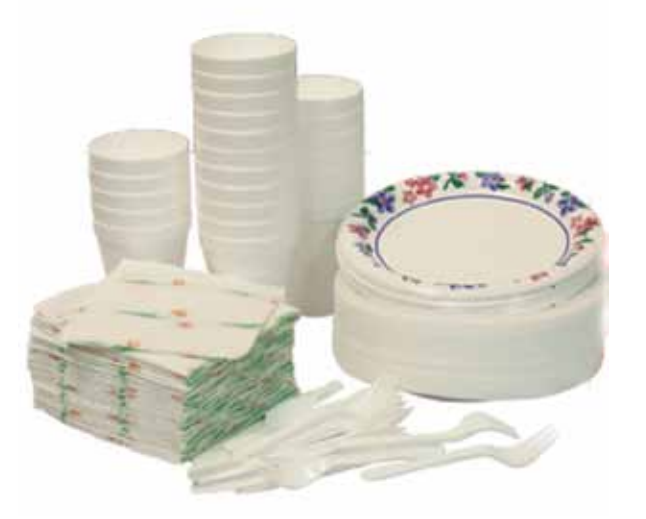
Paper, Plastic & Styrofoam Serving Items