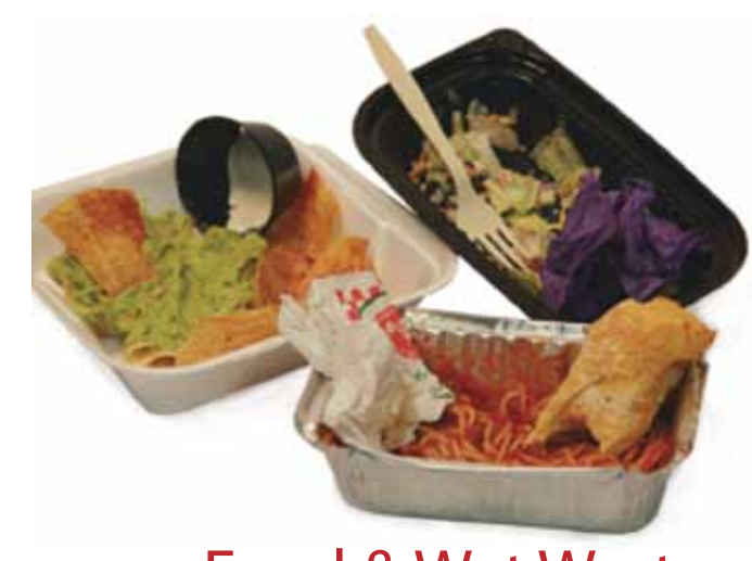
Food & Wet Waste