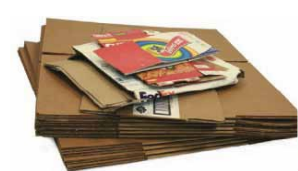
Cardboard, Cereal & Other Paperboard Boxes. Brown & White Paper Bags