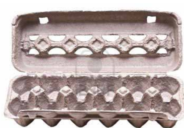
Paper Egg Cartons *no Styrofoam egg cartons