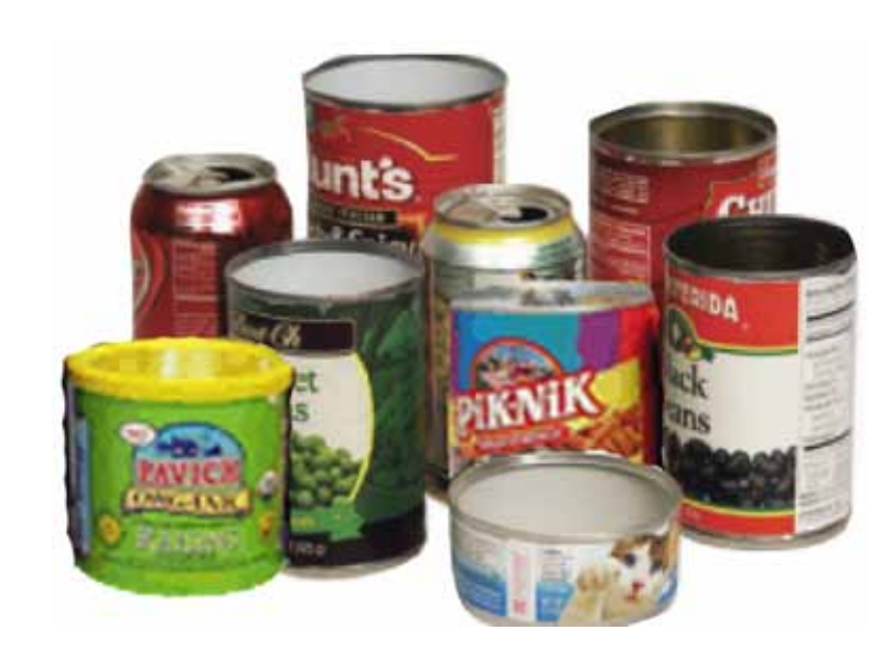
Aluminum, Steel & Spiral Wound Paperboard Containers

Please keep paper separate from containers - Please rinse containers