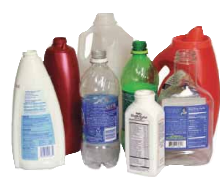
Plastics #1 & #2 *no Styrofoam or Plastics #3-#7, no Oil or Antifreeze containers

*Cardboard boxes need to be flattened and/or cut to fit inside the container.